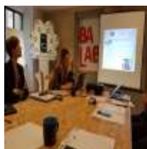
Presentation of the project within a meeting organized by the University of Bari