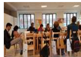
Presentation of the Data Warehouse system in Bari