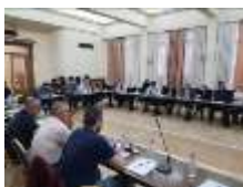
Presentation of the e-tools to representatives of the Achaia Chamber of Commerce and in an event in Messolonghi